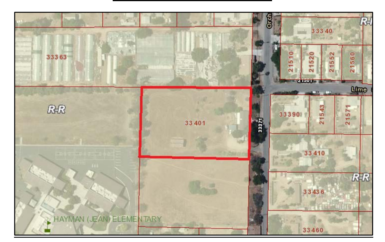
Figure 3. Zoning Designation Exhibit