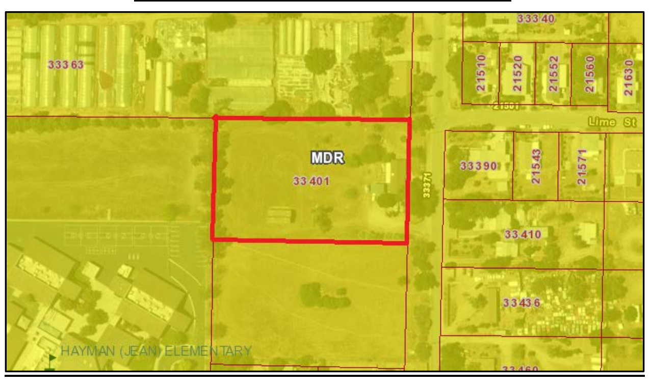
Figure 2. General Plan Existing Land Use Exhibit